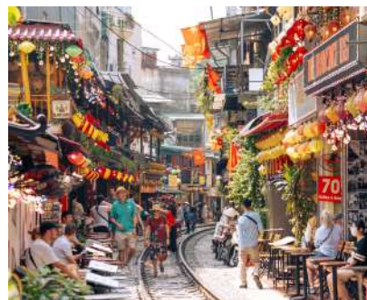
Train Street Coffee