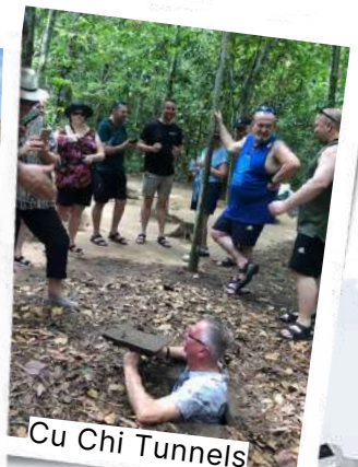
Cu Chi Tunnels