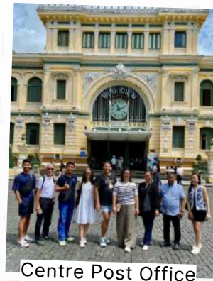
Centre Post Office

Distance Saigon Central – Cu Chi Tunnels: 70 km => 2 hour transfer