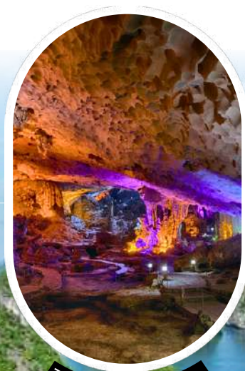
Thien Cung Cave