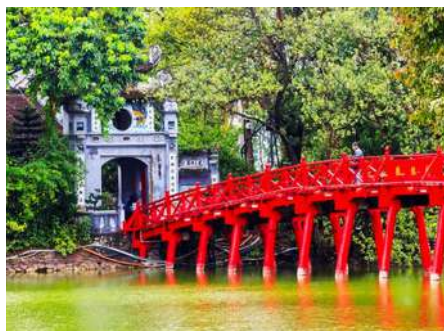
Ngoc Son Temple