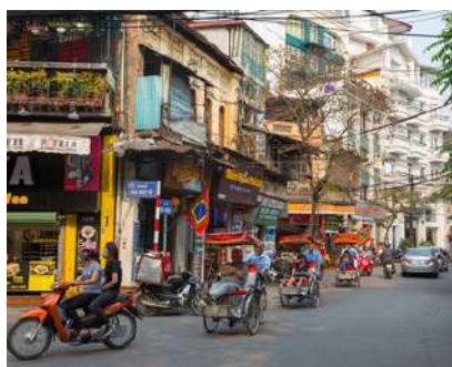
Hanoi Old Quarter

Noi Bai airport – Hanoi Central: 35 km => 45 minute transferring